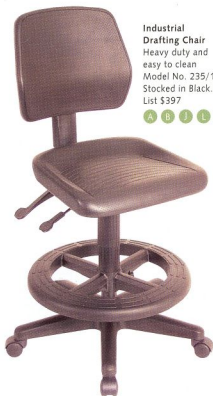
Industrial Drafting Chair Heavy duty and easy to clean Model No. 235/1005K Stocked in Black. List $397