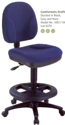
Conformatic Drafting Chair Stocked in Black, Grey and Navy Model No. 3501/1005K List $270

Our collection of drafting chairs combines aesthetics with practicality. Choose the style which best suits your needs and budget. All our drafting chairs are of heavy duty construction and feature a Limited Lifetime Warranty.