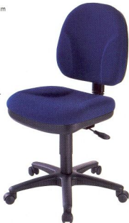
Comformatic Task Chair Model No. 3501 Stocked in Black, Grey and Navy Fabric. List $211