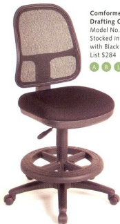
Comformesh Drafting Chair Model No. 7301/100SK Stocked in Black Mesh with Black Fabric. List $284

Breathable mesh back and contoured seat make the Comformesh series a top choice for comfort and value. Features molded foam seat pan and ratchet back height adjustment.